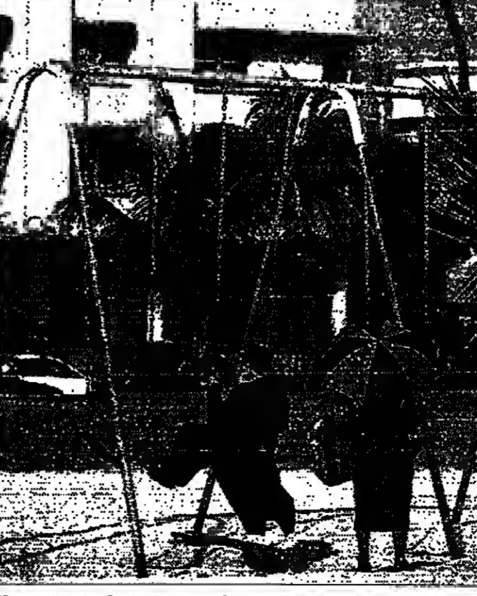
Even elderly Orthodox men have a little boy in them, yearning to break out sometimes. The swinging couple was spotted in Miami Beach.